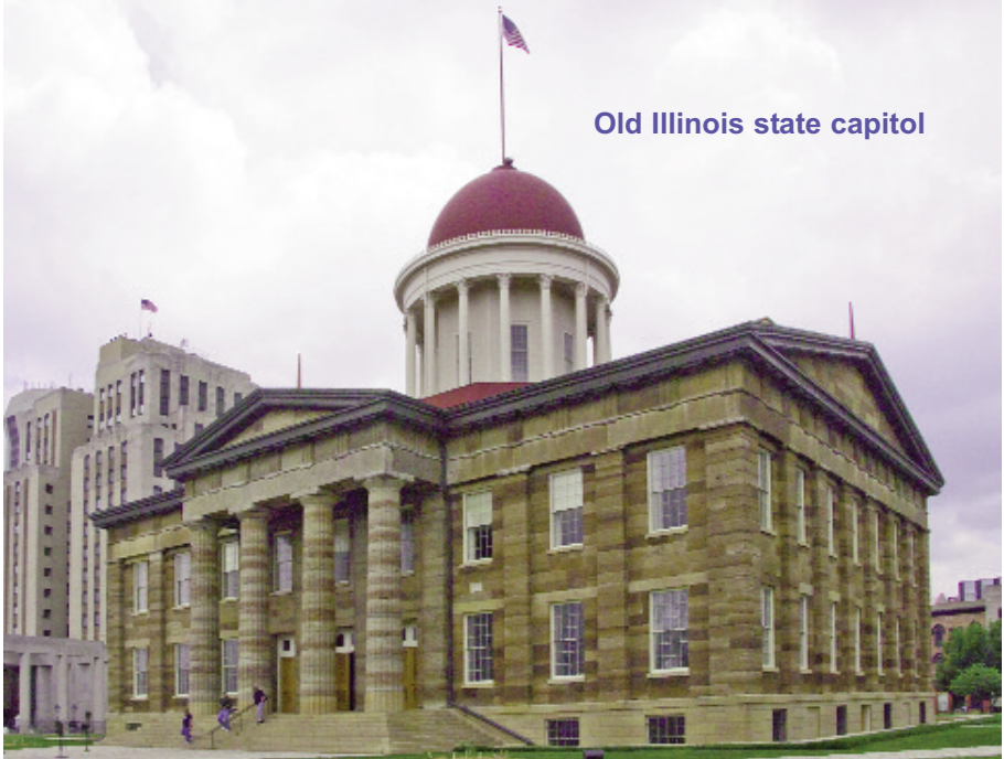
Old Illinois state capitol

the Lincoln sites in this Illinois capital city are accessible.